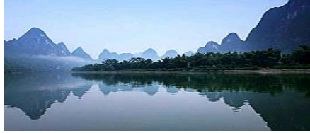
Guilin, Guangxi Autonomous Region, China