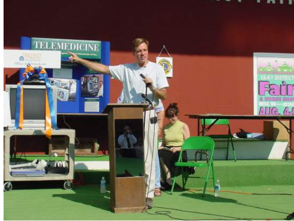
Governor Mark Warner