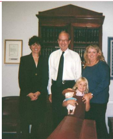
Congressman Rick Boucher Co-chair, Congressional Internet Caucus