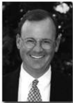
State Senator William Wampler